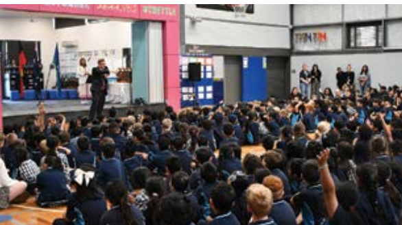
Fabulous assembly with students, staff and parents at Tulliallan Primary School in Cranbourne North.

Cost-of-living relief will continue to be the Labor government's number one priority.