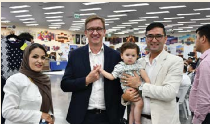
Viewing exceptional handicrafts, jewellery and clothing at the SAMAR Art & Business Expo in Dandenong.