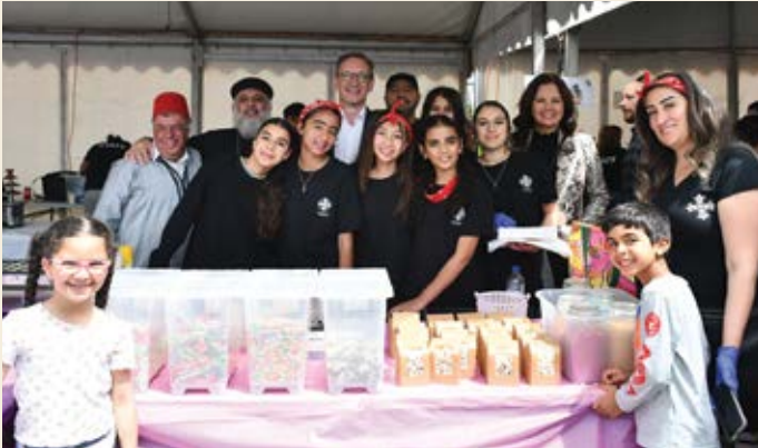
Enjoying fantastic food at the St. Mina & St. Marina Coptic Orthodox Church festival.