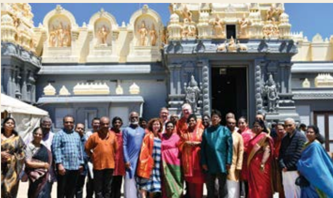
Visiting Melbourne's amazing Shri Shiva Vishnu Temple during Thai Pongal.