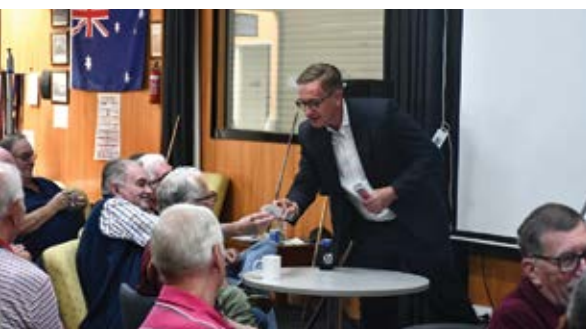
A warm welcome and great conversation about local and national issues at Berwick Men's Shed.