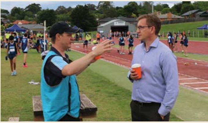
Berwick Little Athletics gets kids off screens and doing healthy stuff outdoors.