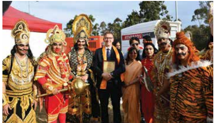
Hindu message of good over evil at the Dussehra Festival.