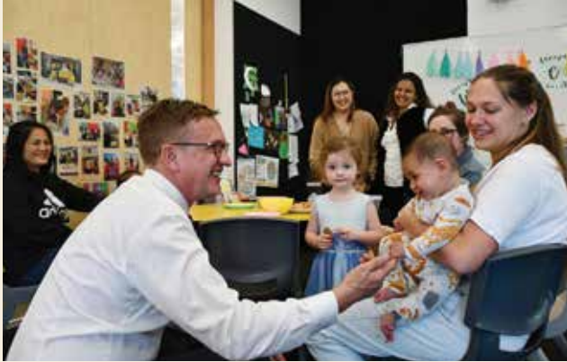
Visiting the Community Hub at Fleetwood Primary School in Narre Warren.