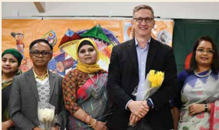
Delightful event in Berwick with the South East Bangladeshi Cultural Foundation.