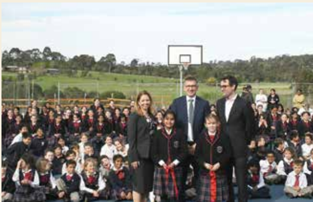
New netball courts and classrooms at Harkaway Hills College in Narre Warren North.