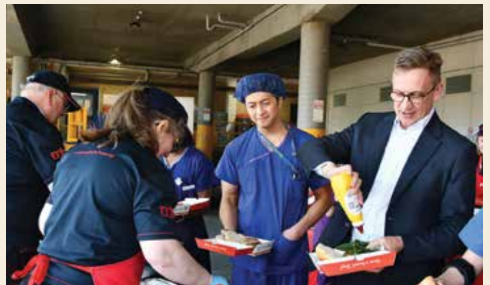
Thanking the dedicated Dandenong Hospital staff at the Rapid Relief Team free BBQ.