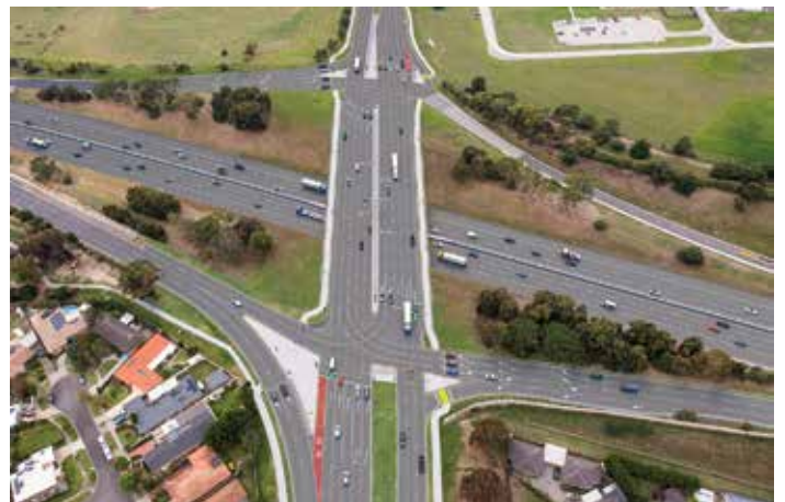
Artist's impression of the completed project.

The latest edition of The Little Book of Scams is now available in English and translated into 17 other languages. You can download it from www.scamwatch.gov.au or get the printed booklet posted to you for free by calling Julian Hill on 9791 7770 or email julian.hill.mp@aph.gov.au .