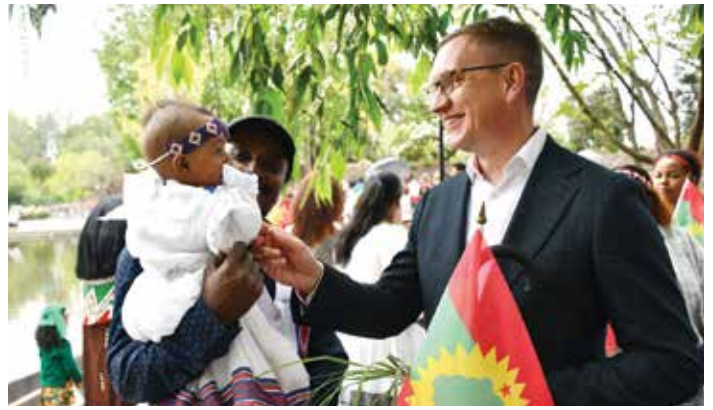
Irreecha Day Festival at Wilson Botanical Park, Berwick.

The government is also taking action to stop businesses ripping off Australians by banning unfair trading practices under the Australian Consumer Law.