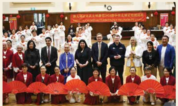
Mid-Autumn Festival fun. Tai Chi is great for physical and social wellbeing.

There is so much for us as Australians to be proud of and celebrate. But in doing so we should also take stock. The truth is that many Australians from diverse backgrounds still don't get the fair go we all deserve and expect.