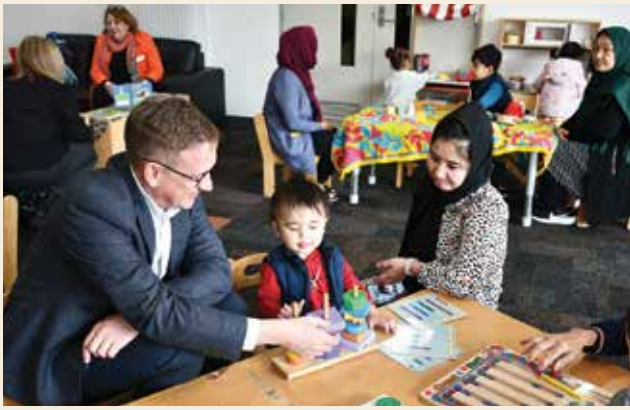
Happy playgroup for newly arrived families at Doveton College.