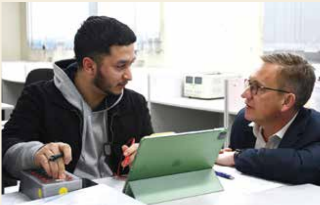
Chisholm TAFE at Berwick and Dandenong provides skills training for the jobs of the future.