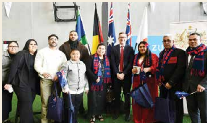
Citizenship Ceremony with Melbourne Football Club at Casey Fields.

Whether we are citizens through birth or because we have chosen Australia as our new home, Australian citizenship is the common legal bond that binds us as a people. We all get one vote and are equal under the law.