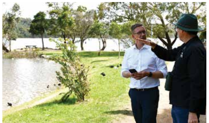
At Lysterfield Lake. The annual Aussie Bird count enables people of all ages and experience head outdoors to have fun getting to know their local birds and collect information about the birds around us.