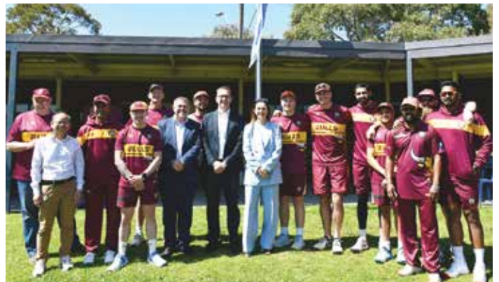
Unfurling the Premiership flag at Dandenong West Cricket Club.