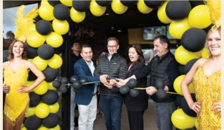
Cutting the ribbon at the official opening of a new local kebab business.

A future made in Australia is about seizing the opportunities of renewable energy to build a prosperous economy and makes things here again.