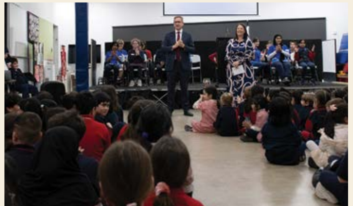
Students at Southern Cross Primary in Endeavour Hills are excited about their new basketball and netball courts.