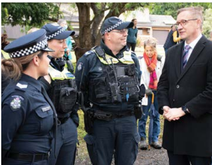
Talking with local police officers who help keep our community safe.