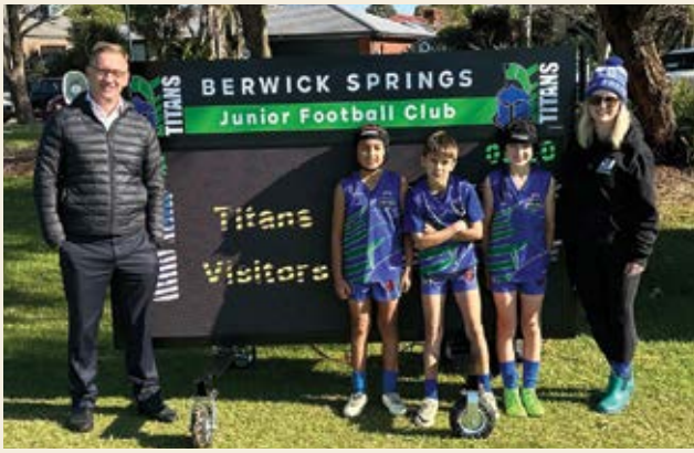
A Stronger Communities grant helped Berwick Springs Junior Football Club get their new scoreboard.