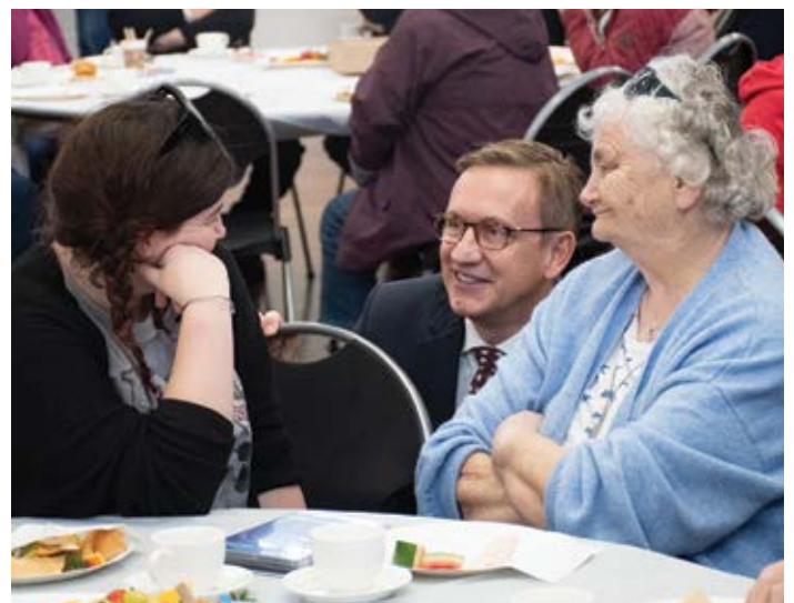
Always a delight to have a cuppa and chat with locals at the Bruce Community Morning Tea.