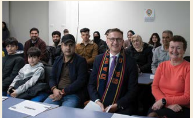
Pashto language welcome to Australia class for new arrivals from Afghanistan.