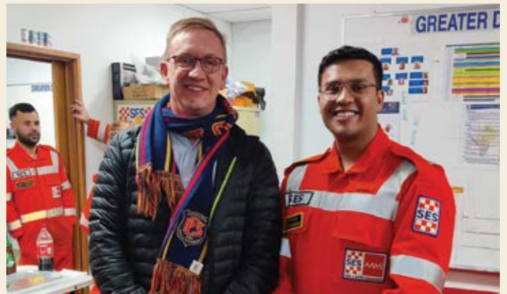
Catching up with the wonderful volunteers at the State Emergency Service Dandenong Unit.