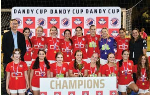
Congratulations to the winners and all the girls who competed in the Dandy Cup.