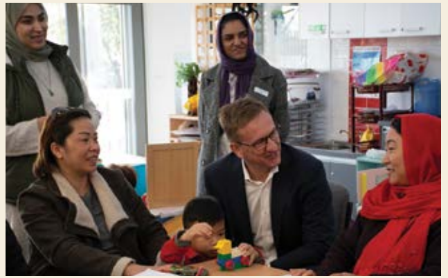
A federal government community childcare grant will help Hallam Learning Centre provide short-term care for kids so mums can focus on working and learning.

Legislation will cap the HELP indexation rate to be the lower of either the Consumer Price Index (CPI) or the Wage Price Index (WPI) backdated to 1 June 2023.