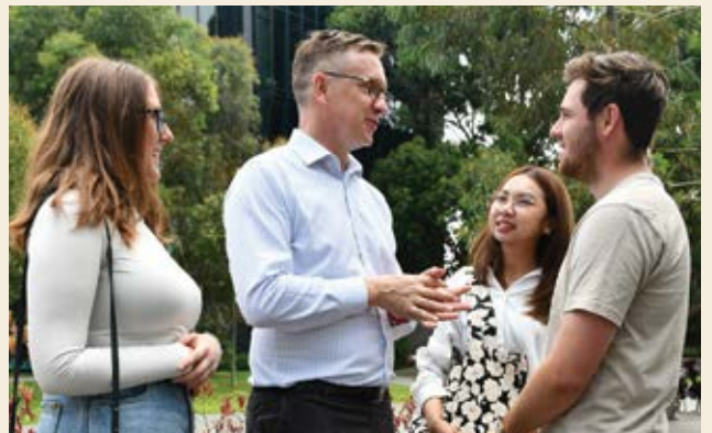
Discussing the challenges of making ends meet, and balancing study and work with local university students.