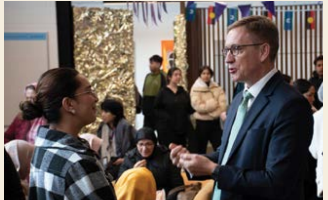
South East Community Links student support services are now available onsite every fortnight at Chisholm TAFE Dandenong campus.